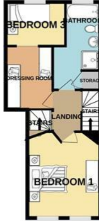
1ST FLOOR 423 sq.ft. (39.3 sq.m.) approx.